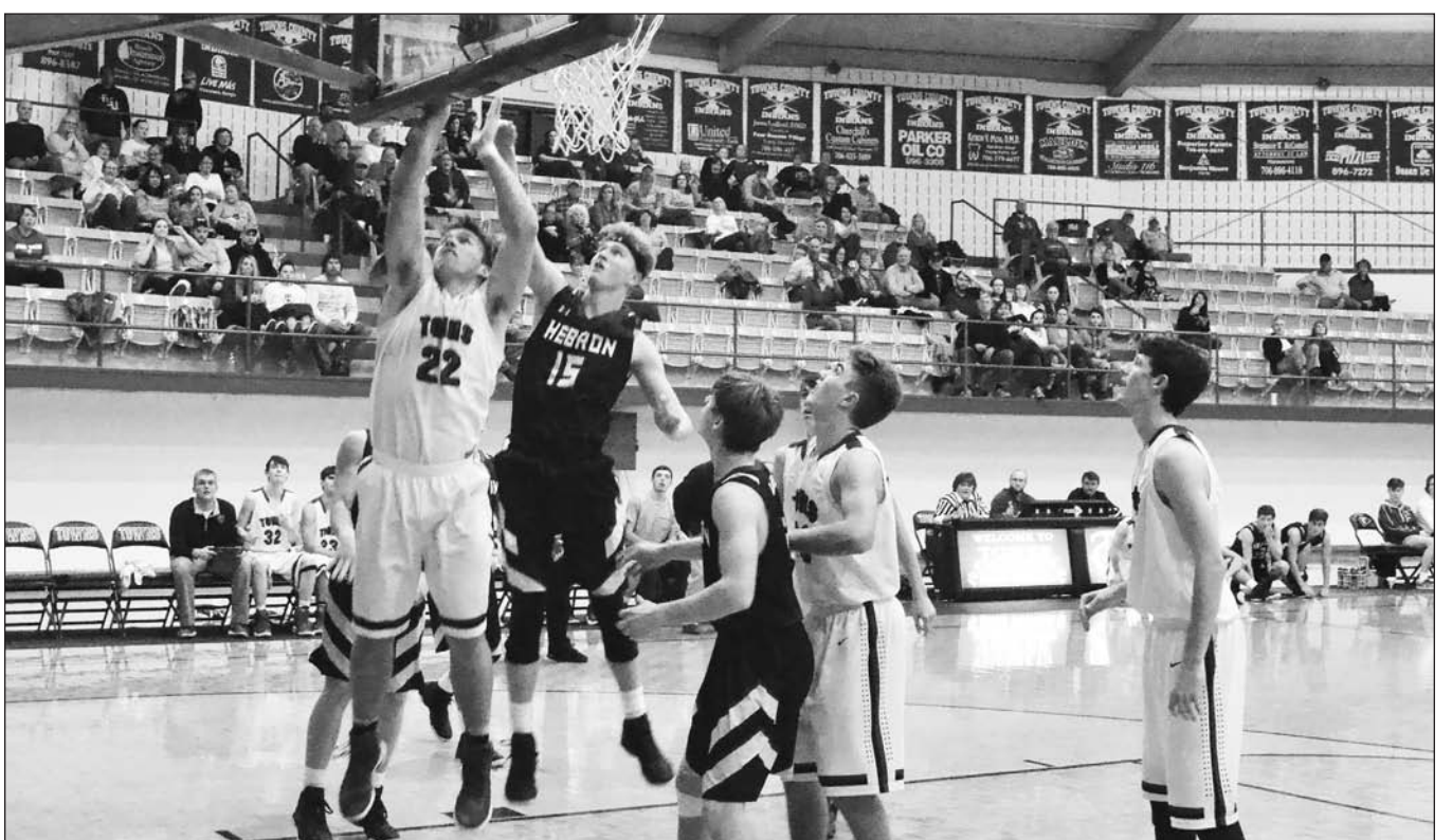
Towns County battles Hebron at home and Athens Academy on the road last week.

The Indians have already qualified for the Class A Public State Tournament with the open-